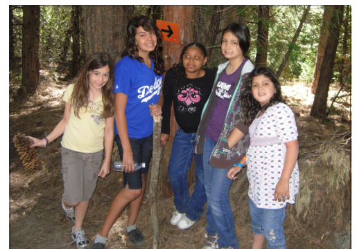
Hiking in the woods is a great part of summer camp!

Staff is looking forward to a new camp program this summer that will increase our ministry opportunities. Rather than the usual full week of summer camp at a costly facility we are