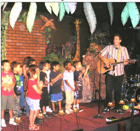
Summer Fun Urban Camp is a great way for kids from the neighborhood to experience Jesus!

introducing a series of shorter Super Summer Camps : Survivor & Victor Cabin Camp in the San Bernardino mountains will feature 3 days and two nights for kids ages 9-11. Zion Beach Camp in Ventura will feature a camp for teens, and our first ever Family Camp will be held at Dogwood Campground in the San Bernardino Mountains as well. Family camp will feature a program that brings godly interaction between parents and their children. We will be offering our annual week-long Summer Fun Urban